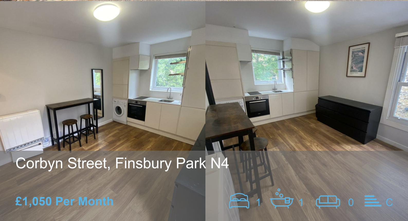
Corbyn Street, Finsbury Park N4